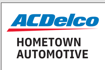
4' High x 6' Wide