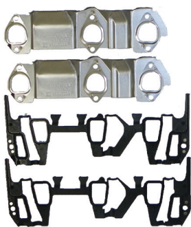
CYLINDER HEAD GASKET KIT