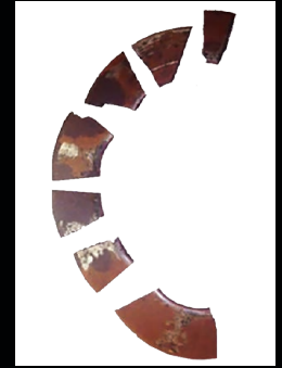
Failed Spring Disc