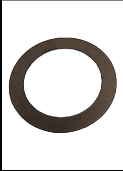
Belleville Spring Disc