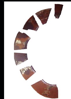
Failed Spring Disc