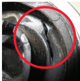
TORN BUSHING Load forces will tear bushing from sleeve