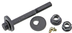
Hardware included for complete install (MS251123/4)