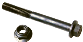
Hardware included for complete install (MS251112)