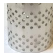
Straight lock perforated core design

Important: Engine damage resulting from an incorrect or improperly installed engine oil filter is not a warrantable claim. Oil filter misapplication may cause abnormal engine noise or internal damage. The best way to avoid oil filter quality concerns is to use ACDelco oil filters.