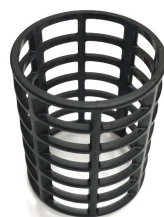
ACDelco eDesign core