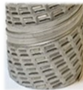
Spiral wound with louver core design